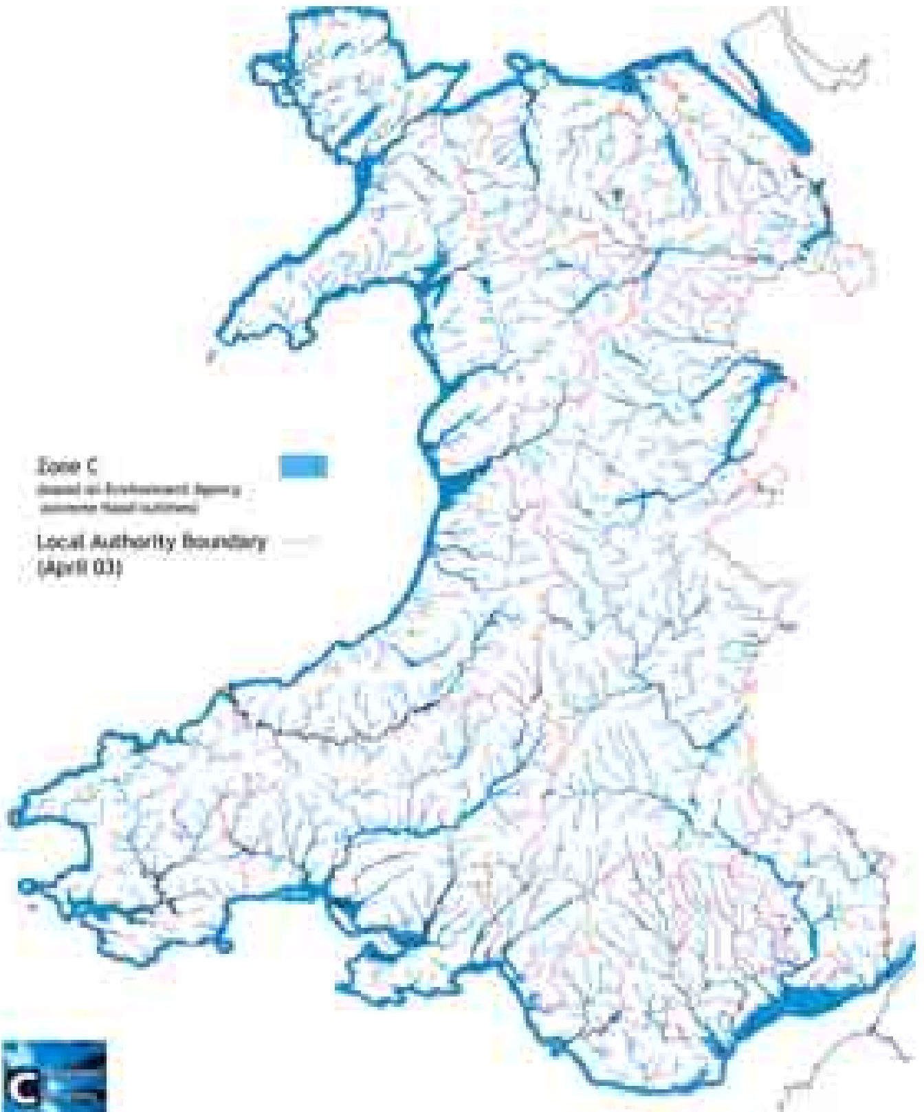
Illustration of Zone C across Wales